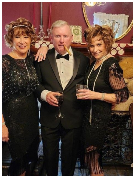
Crater Lake Trip